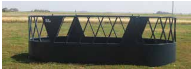
FEP-HD FEEDER PANELS - our feeder panels can be used to extend any of our two piece feeders to give it twice the capacity for a lower cost of buying two feeders