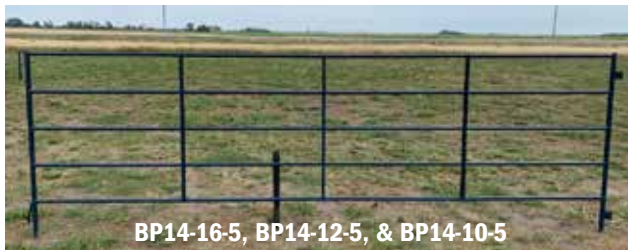
BP14-16-5, BP14-12-5, & BP14-10-5