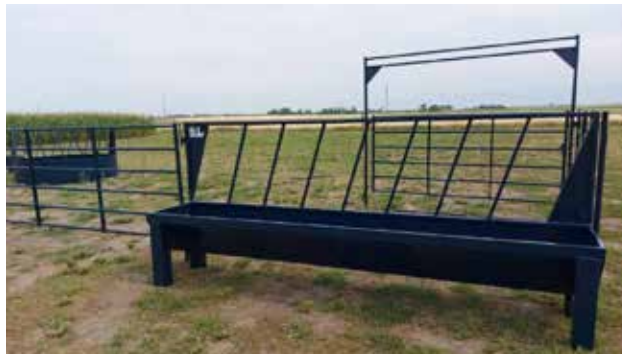
FENCE-LINE FEEDER - our fence-line feeder comes in 12' and 20' lengths and is made with 12g material and HD 5x5 legs. This can be integrated with our panels and panel gates. Add as many feeders as needed, this feeder panel has the same connections as our panels and panel gates.