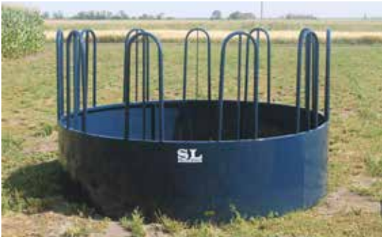
BFE-TMS - Tombstone feeder 8' diameter 58"H x 96"W