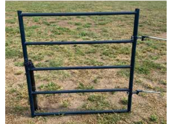
4 x 14-4

Our cattle gates come in different sizes of 4' 10' and 16'. They are easy to install and come with heavy duty adjustable hinges with 9" x 3/4 bolts to fasten them to any post. Our gates are built with a .100 wall round tube 1.66" frame and 1.25" rails.