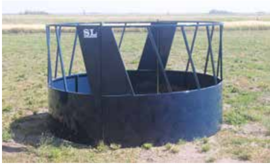
98" x 58" Bale Feeder - our bale feeder comes in two pieces for easier shipping and handling. Can easily be joined on site.