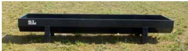
BUNK FEEDERS - our bunk feeders come in 12' and 20' sizes. Made out of 12g material with HD 5x5 legs