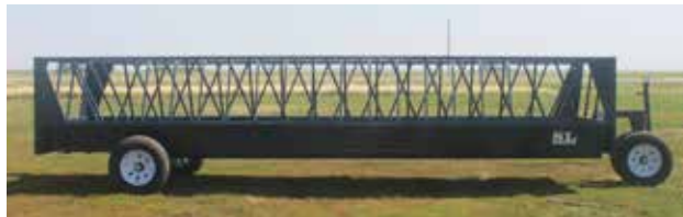
BFW-24 FEED WAGON - our 24' feeder wagon has 40 feeding spaces, can be used for round bales, square bales, grain, or silage. Wagons come in 16', 20', 24' and 30' options.