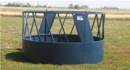
SF2-HD Heavy-duty two-piece bale feeder 98"H x 58"W